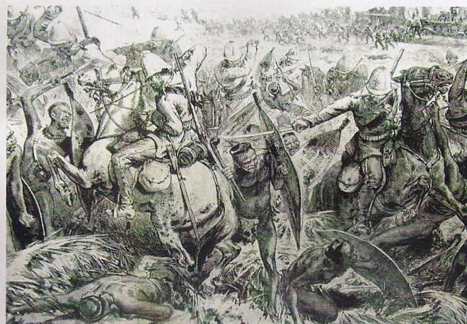
'Men of HMS 'Shah' in the Laager at Gingilovo.'