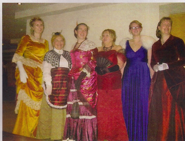
Some of the ladies and their stunning dresses